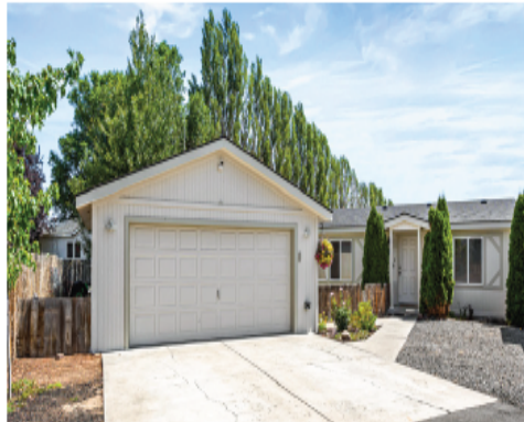
1035 Tieton Estates Dr, Yakima