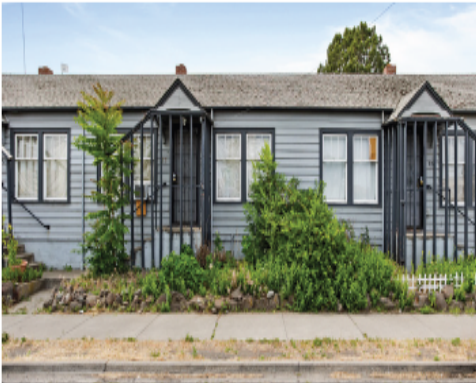
920-922-924 Terrace Heights Way, Yakima