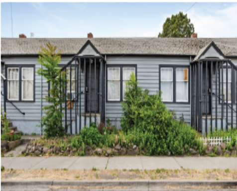
920-922-924 Terrace Heights Way, Yakima