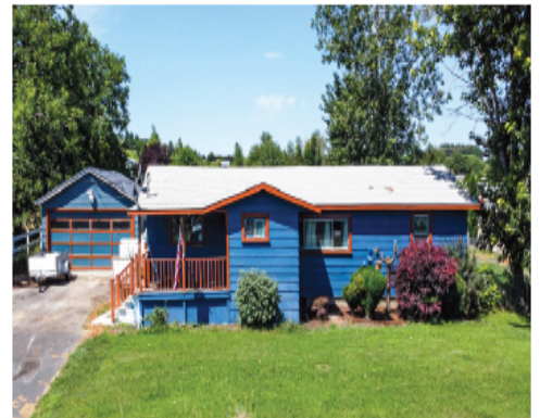
1670 Selah Loop Rd, Selah

Offered at $350,000. Great investment opportunity, income-producing property, with excellent rental history and long term tenant history. Updated plumbing & electrical, 1 unit completely updated inside. MLS# 23-1199.