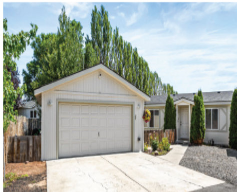
1035 Tieton Estates Dr, Yakima