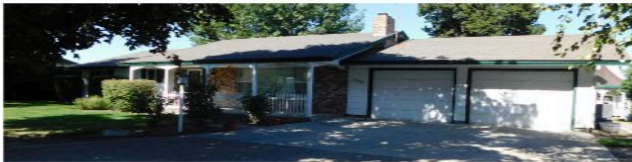
7501 Skyview Ct, Yakima | Offered at $450,000

BERKSHIRE HATHAWAY | Central Washington Real Estate HomeServices