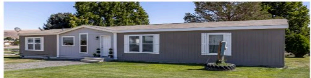
460 McPherson Ln, Selah | Offered at $435,000

Country living at it's best. 3 bedrooms and 2 full baths over a large 1200 SF with potential to almost double. Downstairs is a blank canvas ready for your design, possible second living space with an exterior door. Outside has a beautiful in ground pool. Over 3 acres crossed fenced for horses, cattle, sheep, goats, a chicken coop and duck enclosure. Furnace is 3 years old. This great Selah home is ready for your personal touches. Sellers loan is assumable @ 3.99%. MLS# 22-2324.