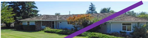
914 Adamsview Rd, Yakima | Offered at $440,000

This 9 bedroom 2 bath is ready for you. If you are looking an Airbnb, transitional living home or space for the whole family- you have found the place. With 5 bedrooms, a full bath upstairs and 4 bedrooms, a full bath downstairs. The 2 car garages was legally converted into 2 bedrooms upstairs. The living area downstairs was legally converted into 2 bedrooms downstairs. Very well cared for home on a large lot, in town living, on a quiet street. Don't forget about the hot tub, with its private room and pebble walls. MLS# 22-1315.