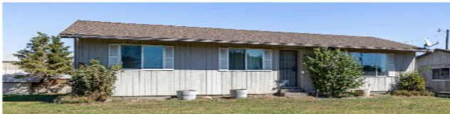
141 McPherson Ln, Selah | Offered at $409,000

Welcome to this 1931 Farmhouse, sitting just outside Zillah with amazing valley view and quiet country living on over an acre. Hard wood floors on the main level and some original doors with skeleton keys. The electrical and plumbing & HVAC have been completely updated. The unfinished downstairs is waiting for your personal touches. Outside enjoy there is plenty of room to entertain, run or play. MLS# 22-2339.