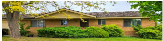
15 N 59th Ave, Yakima | Offered at $570,000

Outdoor living in West Valley- Hidden in a quiet cul-de-sac in West Valley, this 3 bedroom 2 bath home sits on 1.53 fenced acres. The shop has multiple uses including hobbies, crafts, storage, etc. The tack room or garden shed also provides more storage. The well-maintained mature landscape was passionately cared for by a former Apple Tree Golf course greens keeper. Enjoy the backyard outdoor living space, complete with gazebo, outdoor cooking, fire pit and covered patio and large garden area. You will be ready to entertain from day one. MLS# 22-2451.