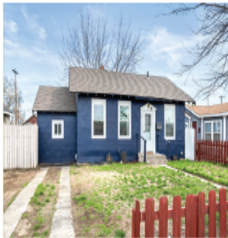
304 S Fir Street, Yakima | MLS# 23-373