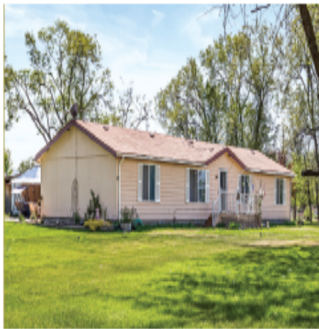
910 Robinson Rd, Grandview | MLS# 23-929