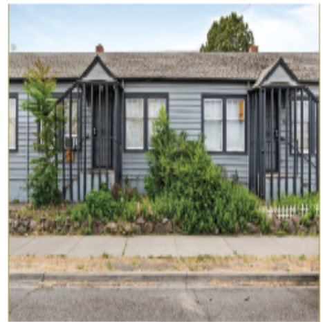
920-922-924 Terrace Heights Way | MLS# 23-1199

Welcome home to this 4 bedroom, 2 bath home on over 2 acres. The addition has plenty of room for gatherings or relaxing. All 4 bedrooms are great size and have large closets. With the space you need on the inside and out, this is the place for you. Call your favorite Realtor today for a private tour.