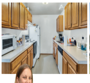
Amanda F R A N K Broker. REALTOR®

Offered at $380,000 3+ bedrooms, 2 bath, 2,536 sq ft, .91 acres. MLS# 23-1517.