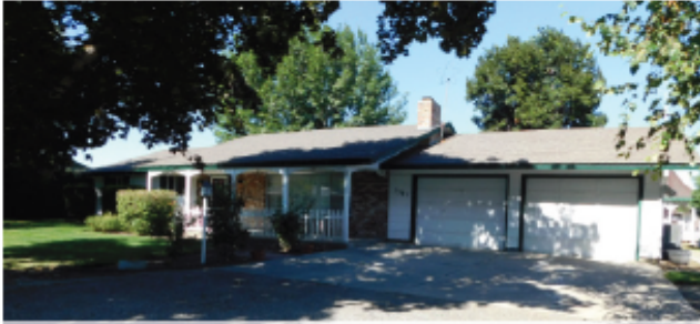
7501 Skyview Ct, Yakima Offered at $430,000 | MLS# 22-2451

Outdoor living in West Valley- Hidden in a quiet cul-de-sac in West Valley, this 3 bedroom 2 bath home sits on 1.53 fenced acres. The shop has multiple uses including hobbies, crafts, storage, etc. The tack room or garden shed also provides more storage. The well-maintained mature landscape was passionately cared for by a former Apple Tree Golf course greens keeper. Enjoy the backyard outdoor living space, complete with gazebo, outdoor cooking, fire pit and covered patio and large garden area. You will be ready to entertain from day one.