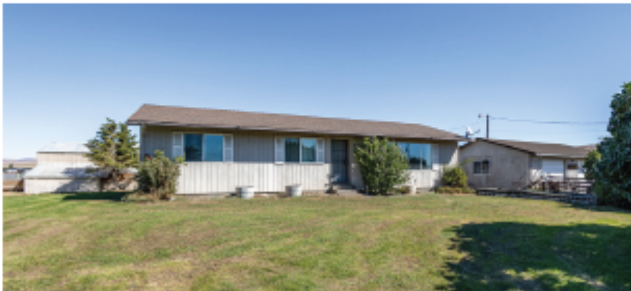
141 McPherson Ln, Selah Offered at $409,000 | MLS# 22-2324

Outdoor living in West Valley- Hidden in a quiet cul-de-sac in West Valley, this 3 bedroom 2 bath home sits on 1.53 fenced acres. The shop has multiple uses including hobbies, crafts, storage, etc. The tack room or garden shed also provides more storage. The well-maintained mature landscape was passionately cared for by a former Apple Tree Golf course greens keeper. Enjoy the backyard outdoor living space, complete with gazebo, outdoor cooking, fire pit and covered patio and large garden area. You will be ready to entertain from day one.