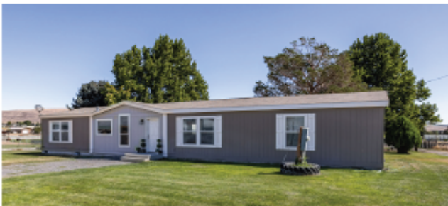
460 McPherson Ln, Selah Offered at $435,000 | MLS# 22-2323

Country living at it's best. 3 bedrooms and 2 full baths over a large 1200 SF with potential to almost double. Downstairs is a blank canvas ready for your design, possible second living space with an exterior door. Outside has a beautiful in ground pool. Over 3 acres crossed fenced for horses, cattle, sheep, goats, chicken coop and duck enclosure. Furnace is 3 years old, This great Selah home is ready for your personal touches. Sellers loan is assumable @ 3.99%.