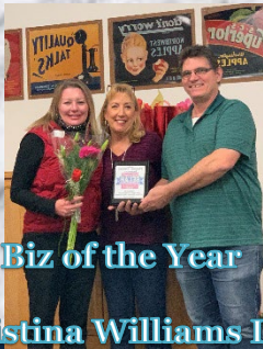
Biz of the Year