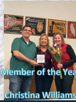
Member of the Year