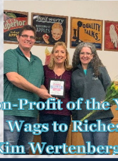
Non-Profit of the Year Wags to Riches