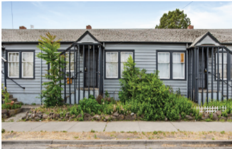
920-922-924 Terrace Heights Way, Yakima