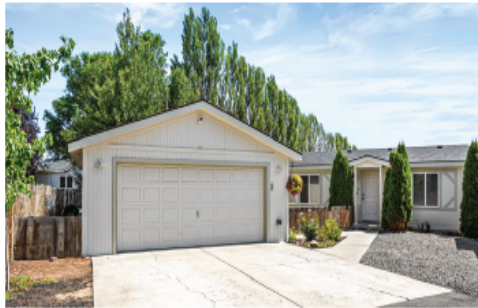
1035 Tieton Estates Dr, Yakima