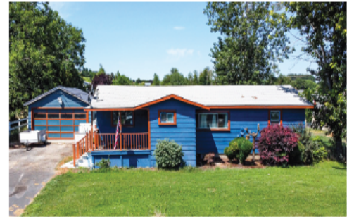
1670 Selah Loop Rd, Selah

Offered at $350,000. Great investment opportunity, income-producing property, with excellent rental history and long term tenant history. Updated plumbing & electrical, 1 unit completely updated inside. MLS# 23-1199.